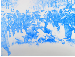
Frank Selby, Light Blue Riot , 2010. Watercolor on mylar, 18 x 24 inches. Courtesy of the artist and Museum 52.