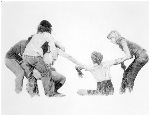
DP16: Andrea Bowers, Non Violent Protest Training, Abalone Alliance Camp, Diablo Canyon Nuclear Power Plant (detail), 2004. Graphite pencil on paper, 38 x 49 3/4 inches.