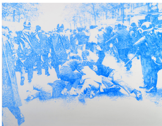
DP39: Frank Selby, Light Blue Riot , 2010. Watercolor on mylar, 18 x 24 inches.