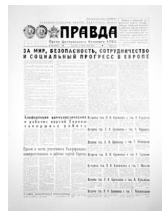
DP46: Karl Haendel, Untitled (Birthday Drawing) , 2000. Pencil on paper, 53 x 43 inches. Lafaille Collection, Los Angeles.